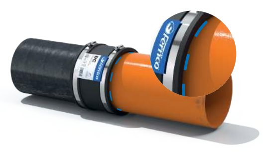
4. Position the remaining pipe, ensuring the coupling face and marked line are flush. Tighten this clamp band.