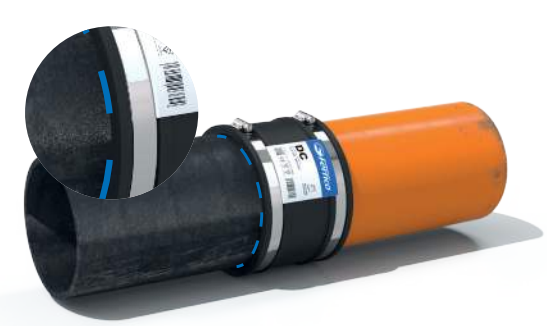
3. Align the pipes and slide the coupling onto the other pipe, ensuring the coupling face and marked line are flush. Tighten this clamp band.