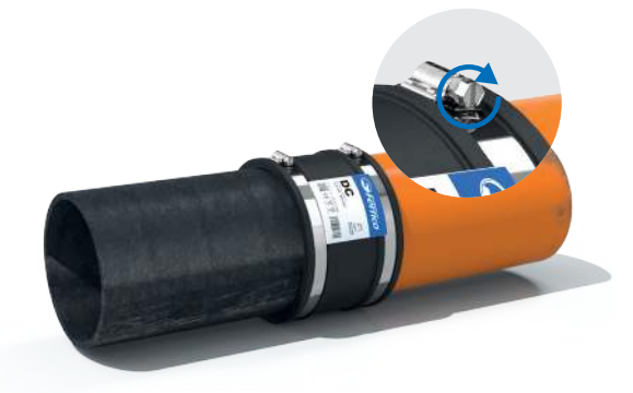
5. Tighten the clamp bands to the recommended torque.

Tamp the bedding under the pipe and re-tighten prior to backfilling.