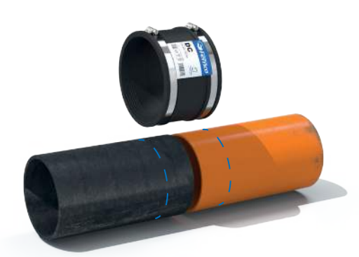
1. Mark both pipes, from the end to be connected, half the width of the coupling, less the required joint gap, which is usually 10mm.